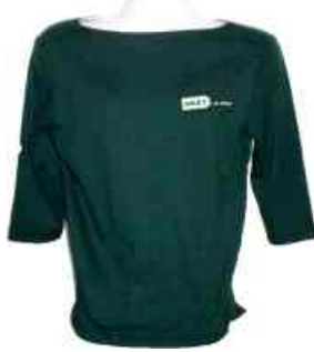
Item #25SI Ladies 3/4 Sleeve Scoop Neck

Colors Available: Hunter Sizes Available: S ~ XL, *2XL,*3XL (*Additional $3.00) $24.00