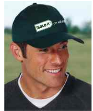
Portflex™ Flexible Fitted Cap. Item #C831

Available Colors: Yellow, Dark Green Unisex sizes: S-*3XL (*2XL & *3XL add $2.00) $30.00