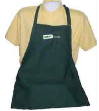
Item #9002 Cobbler Apron

Colors Available: Hunter Sizes Available: S ~ XL, *2XL,*3XL (*Additional $3.00) $26.00