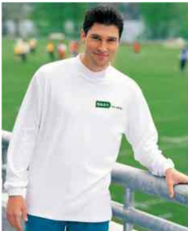
#K321 Interlock Knit Mock Turtleneck

Dark Green Adult sizes: 1 Size Adjustable $14.00