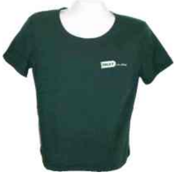
Item #15SI Ladies Scoop Neck

Ladies 100% Cotton, Scoop Neck Top, Short Sleeve