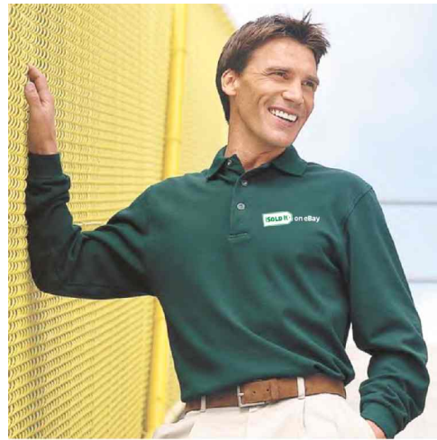
Item #320 Port Authority® - Long Sleeve Polo

Fabric/Style: 7-ounce, 100% ring spun combed cotton pique, garment washed; welt collar, locker patch, rib knit cuffs, double needle stitching, side vents; pewter tone buttons.