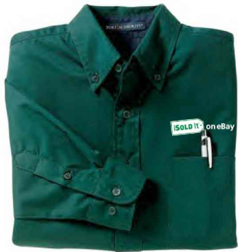
Item #S608 L/S & Item #S508 S/S Men's Easy Care Twill Shirt

Colors Available: Dark Green, Yellow Available Sizes: XS-4XL S-XL: $26.00 *2XL($28), *3XL($29), *4XL($30)