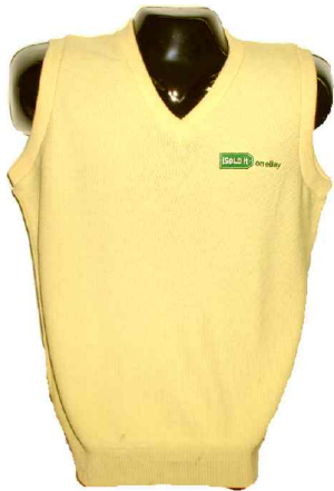
Item #921 V-Neck Sweater Vest

Adjustable One Size Fits All Colors Available: Hunter Green $13.00