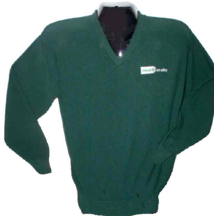
Item #920 V-Neck Long Sleeve Sweater

Available Colors: Yellow, Dark Green Unisex sizes: S-*3XL (*2XL & *3XL add $2.00) $26.00